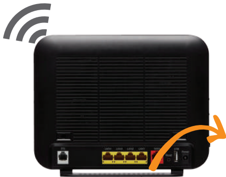
Smart RG SR516

The network name (SSID) and password is on the back of the modem. There are two to choose from. The 5GHz network usually performs the best.